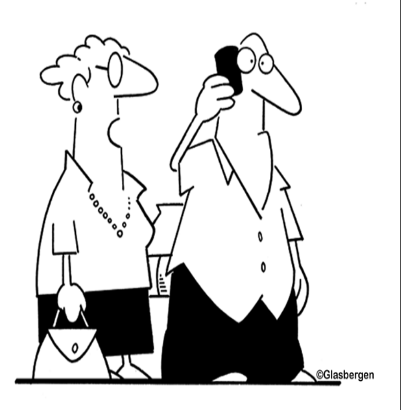
"You're talking to your wallet again!"

On our website you will also find Sermons, Bible Studies, Sunday School lessons, and Bible Related Activities for Children.